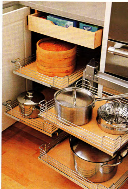
LEFT Corner-turning pull-out shelves allow the owner to access everything stashed in this cabinet. And with the slim pull-out shelf at the top, not an inch of space was wasted, either.