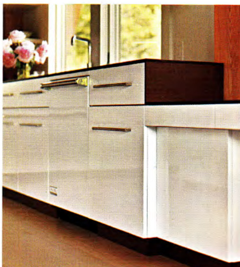
RIGHT The contrasting toe kick beneath these white contemporary cabinets—frameless units with overlay doors and drawers—gives them a floating appearance. The toe kick lends an element of continuity too, by matching the countertop.