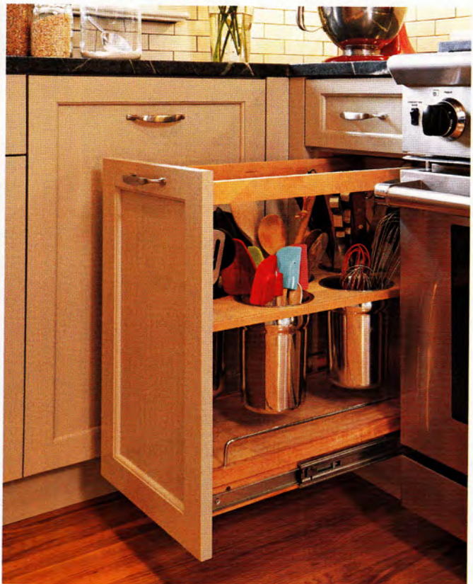
BELOW Kitchen utensils don't need to clutter countertops or drawers. This pull-out cabinet accommodates canisters that keep spoons, whisks, and spatulas close to the stove.