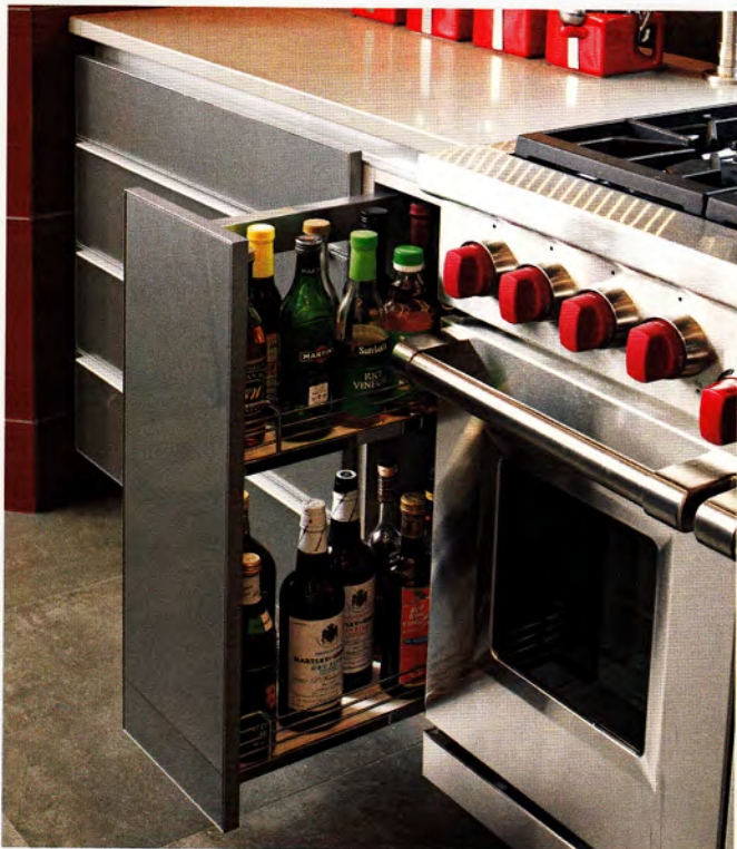
ABOVE Double-decker storage accommodates oils and vinegars in this pull-out cabinet. Low rails allow easy access on one side while taller glides on the other keep items in place.