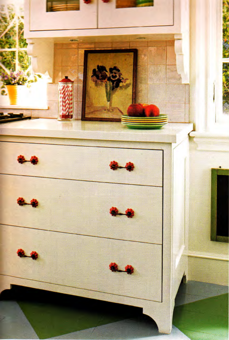
ABOVE This face-frame cabinet—with graduated drawers, fanciful hardware, and carved legs—has a feminine look that’s in keeping with a cottage-style kitchen like this. The addition of matching wall cabinetry creates the appearance of a hutch.