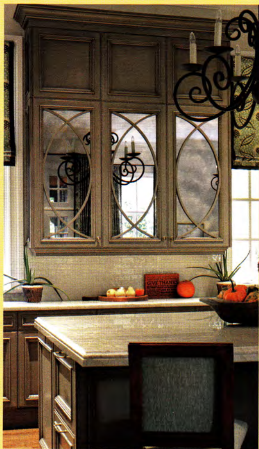
These stacked wall cabinets reach all the way to the ceiling, making the kitchen seem taller in the process. Mirrored door panels add to the spacious effect, bouncing light right back into the room.

t he stacked, or two-level, wall cabinet has an elegance about it. The top cabinet, also referred to as a transom cabinet, can feature windows, which are often glazed and lit from within. And while the transom level is too high for everyday use, it’s ideal for showcasing special pieces. Transom cabinets with solid doors are an option too; they’re perfect for storing lesser-used items.