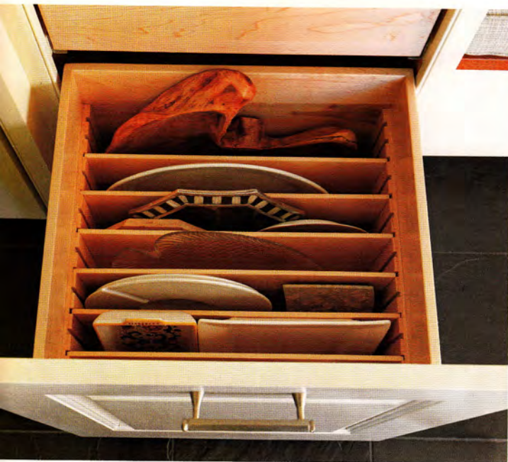
ABOVE Platters are easily accessible in this base cabinet drawer. Best of all, the partitions can be moved at a moment's notice to suit ever-changing needs.